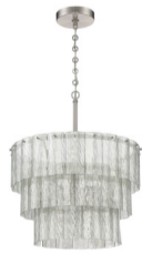
CRAFTMADE Craftmade | 48694-BNK | Museo Collection | Pewter, Nickel, Silver | Nine Light Pendant