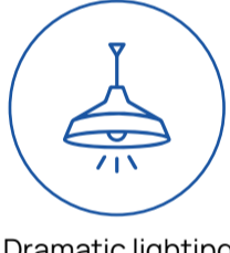
Dramatic lighting arrangement