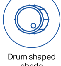
Drum shaped shade