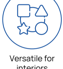
Versatile for interiors