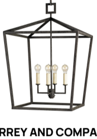
CURREY AND COMPANY Currey and Company | 9872 | Denison Collection | Black | Four Light Lantern