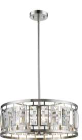
Z-LITE Z-Lite | 6007-22BN | Meresse Collection | Pewter, Nickel, Silver | Six Light Pendant