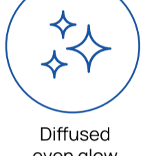
Diffused even glow