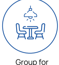
Group for impact